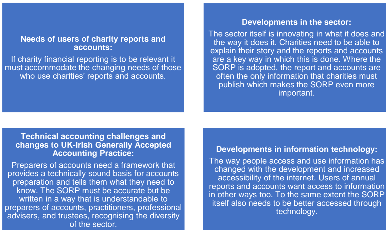
Figure 1: Focal points for SORP development

To be effective, the SORP has to be kept up to date, not just in terms of accounting standards but also the expectations and needs of stakeholders and users. Keeping it up to date is where we now need help from both our SORP Committee members and our engagement partners. There are four areas where we need to keep abreast of changes: