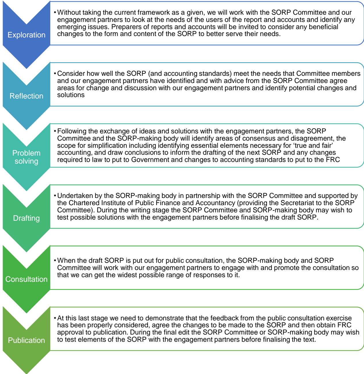
Figure 3: The stages of the SORP development process

Writing the SORP is quite an intensive process; members of the SORP Committee will be advising us on the agenda and issues to present for discussion with our engagement partners as well as considering and advising us on the detail of what is included in the SORP. In the earlier stages of writing the SORP, we expect intensive input from the engagement partners prior to the start of the drafting process.